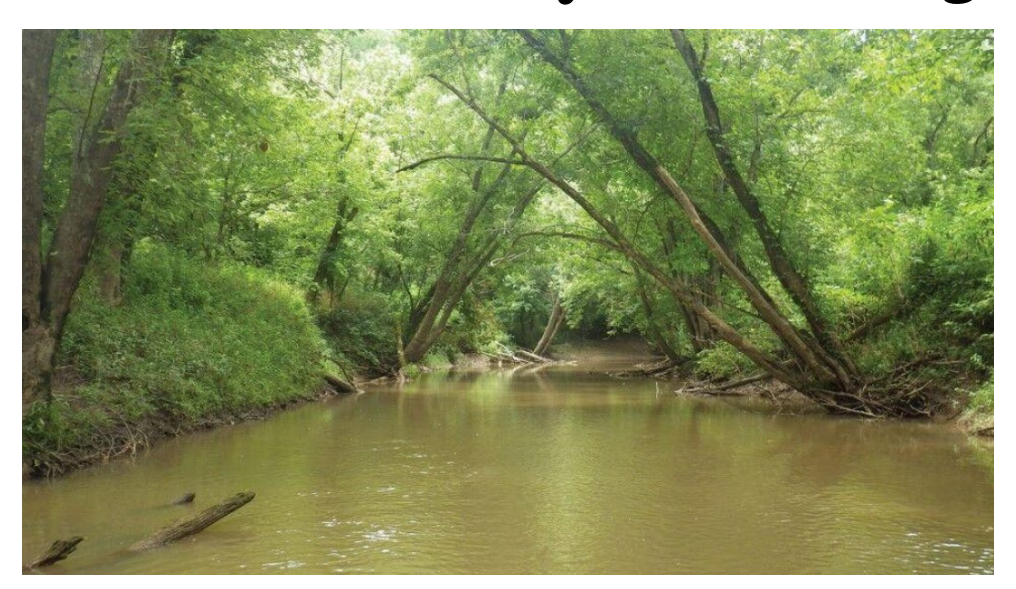
The Lower Guyandotte River watershed.

Mountaintop removal mining and other forms of surface coal mining harm streams by producing high levels of ionic toxicity pollution. This pollution can increase the "conductivity" - or salinity - of freshwater streams, making the water too salty for aquatic life to survive and disrupting entire ecosystems. Ionic toxicity can also im-